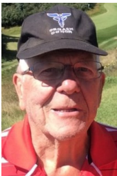
ALLAN FINIGAN Senator, 19607 October 2020